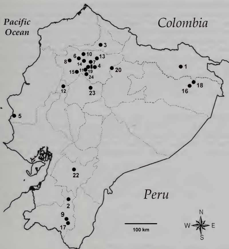
Figure 1. Map of Ecuador showing the study sites; numbers correspond to the localities in Table 1, except for Quito (locality 21) which is represented by a rectangle between localities 4 and 19 for clarity.